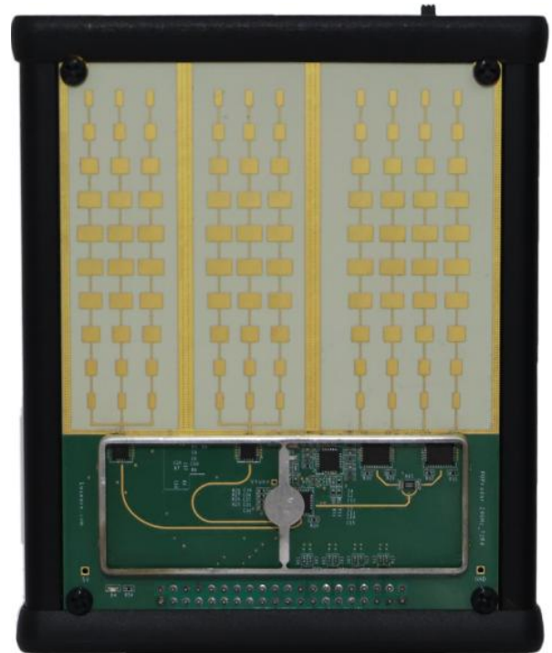
Figure 1. PUP_DUAL24P_T2R4

Raw data can be recorded for post-processing.